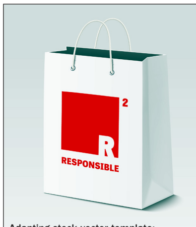
Adapting stock vector template: 13 min. 58 sec.