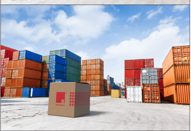
Adobe Dimension CC: 5 min. 36 sec.