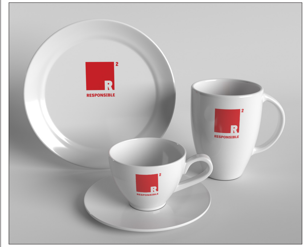
Adobe Dimension CC: 11 min. 53 sec.

In order to properly assess how Adobe Dimension CC compares to the productivity and image quality of a professionally produced studio shot, we worked with a professional photographer with many years of experience in product photography.