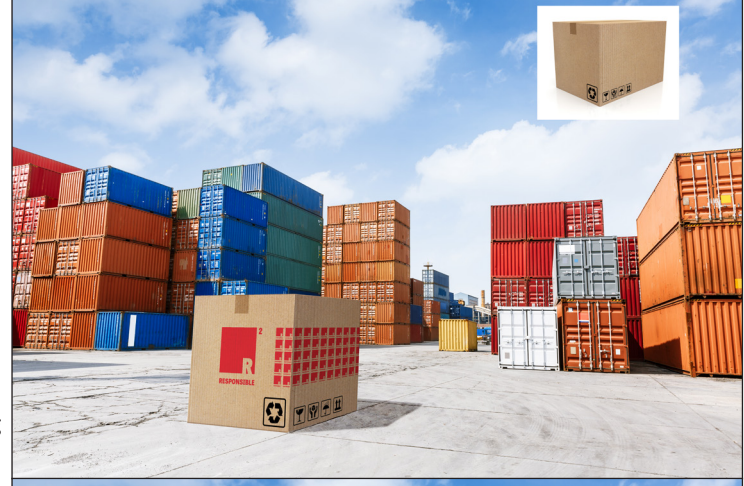
Compositing with stock image: 24 min. 23 sec

For the Dimension scene, we used one of the standard objects available in the program, but we searched for and downloaded a corrugated cardboard material from Adobe Stock directly from within the application.