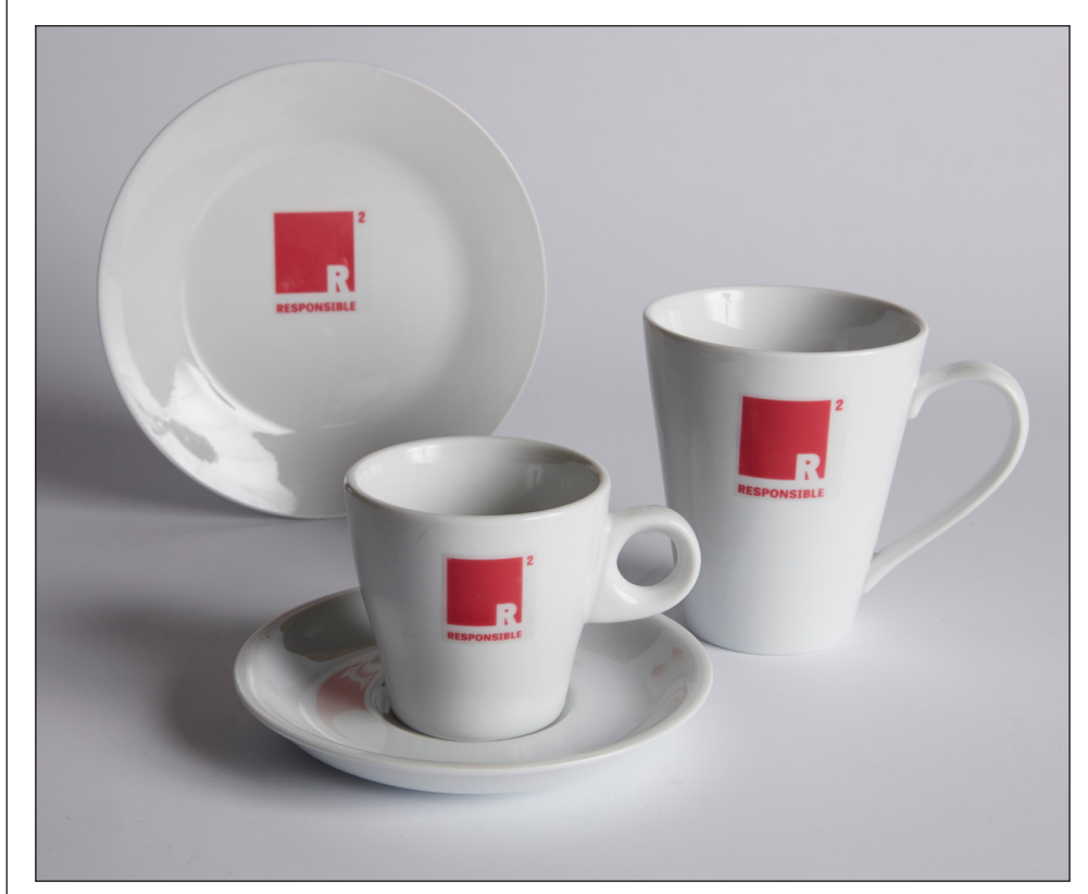
Studio Shoot: 44 min. 29 sec.