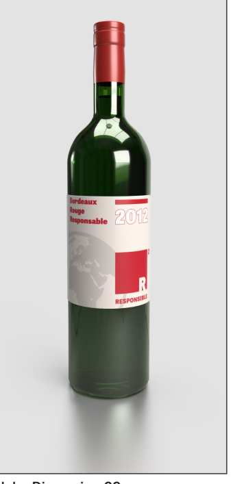
on a wine bottle. In the first case, we used Photoshop's Warp function create a realistic deformation of the label, using a stock image of a bottle. The second option we measured was to create a mock-up with a real wine-bottle and a printed label. For Dimension we downloaded a 3D model of a wine bottle from

About the assignment: Our second real-world benchmark consisted in producing a credible visualization of a label-design